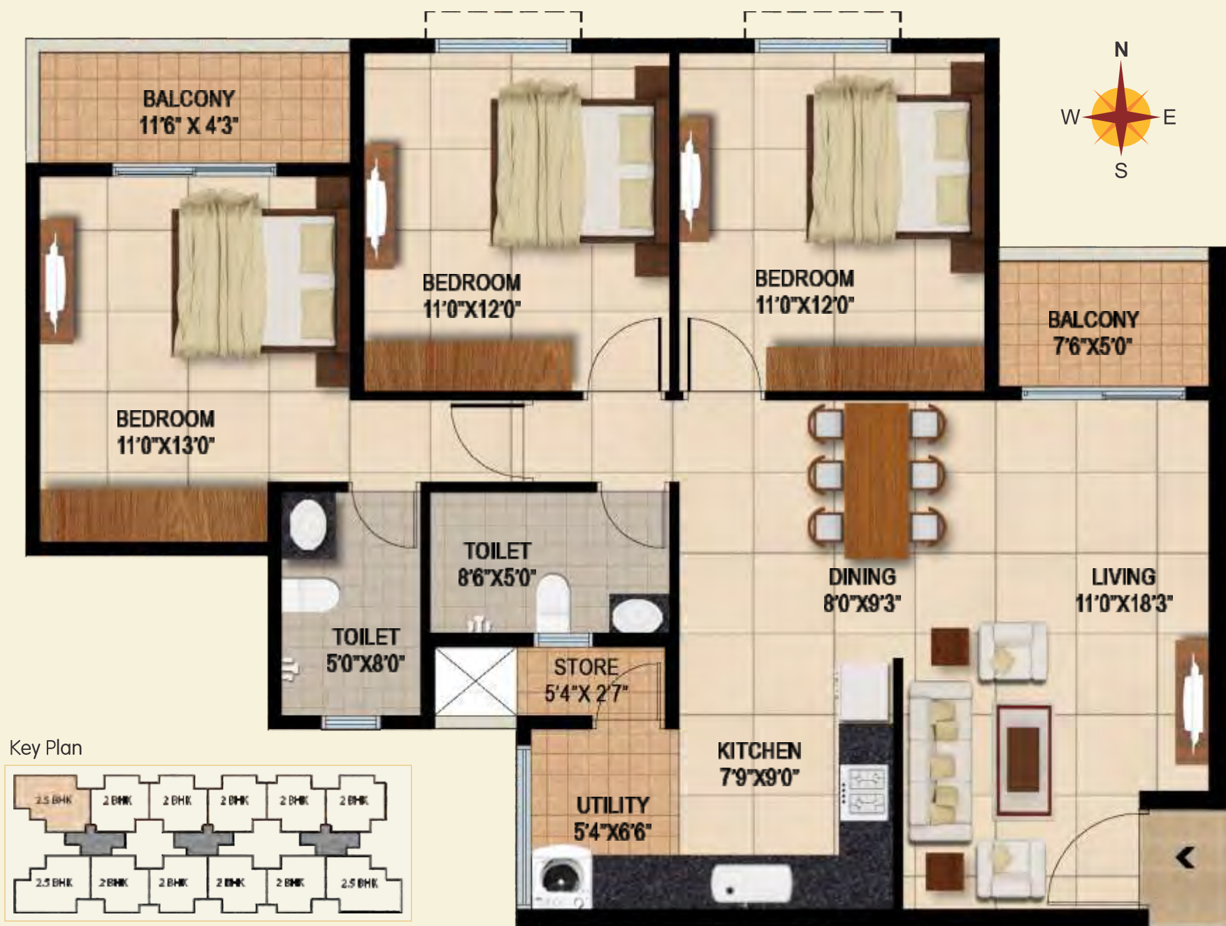
Floor Plan — Type 2