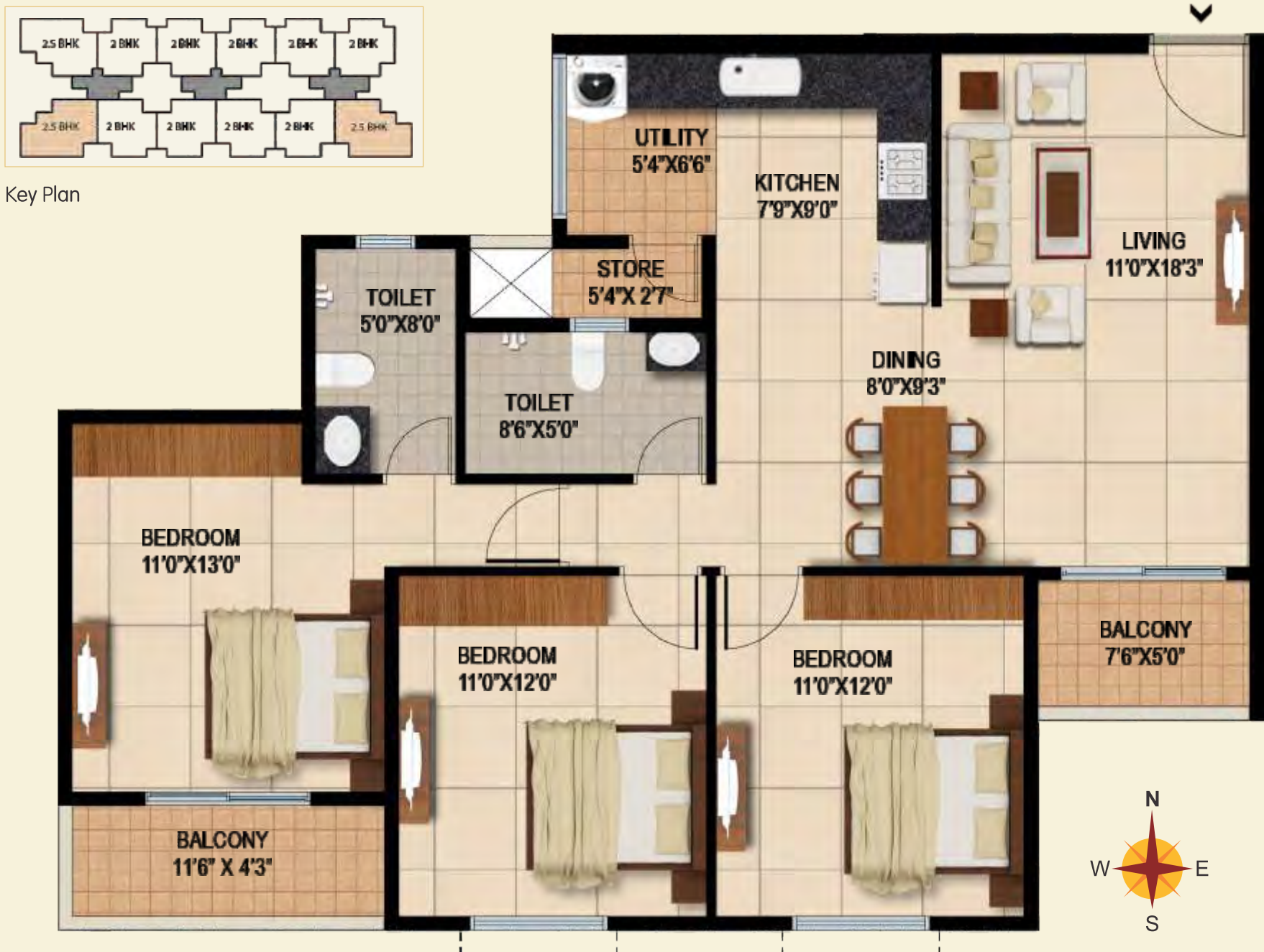
Floor Plan — Type 2A