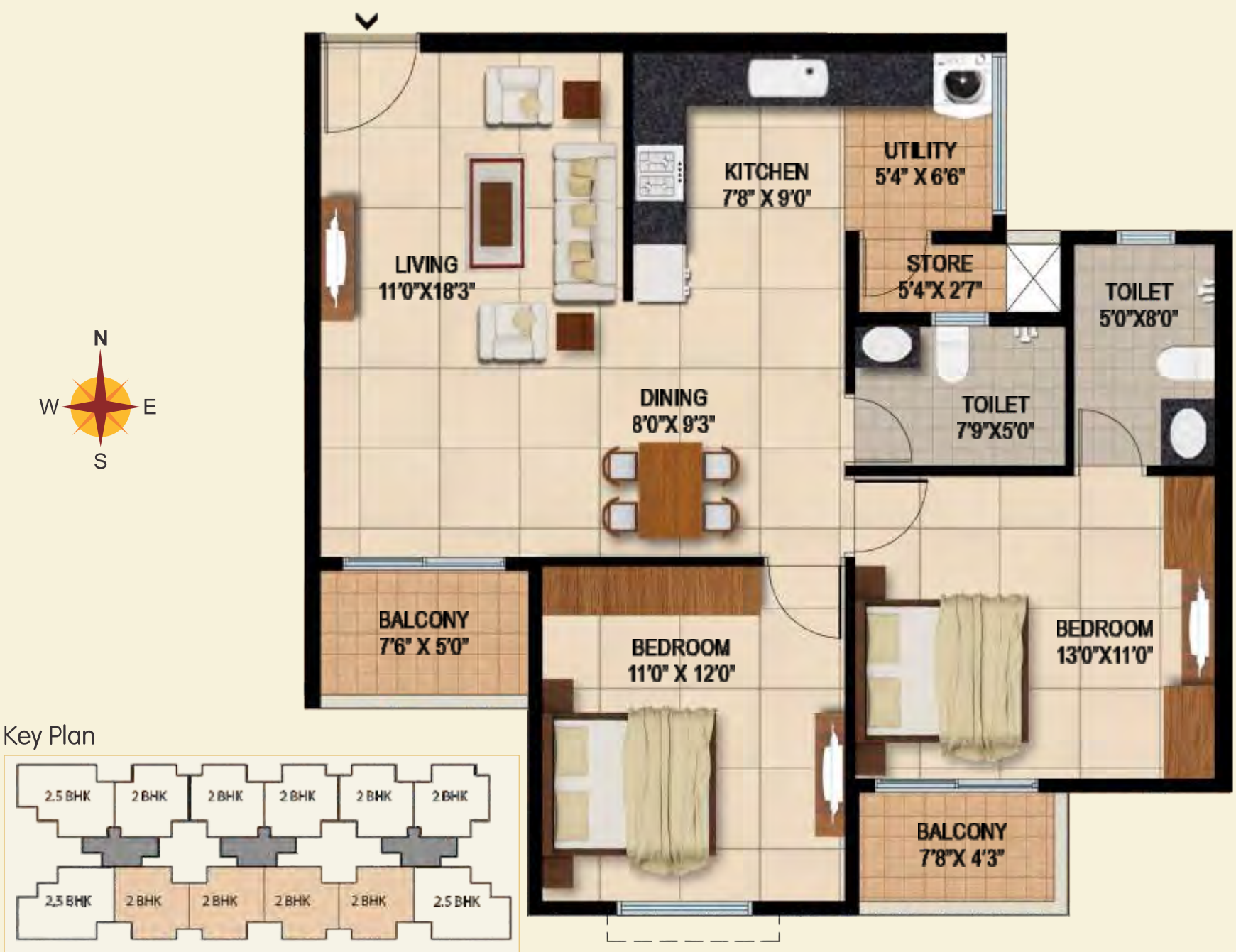
2 Bed + 2 Bath | Area: 1065 sqft

TYPICAL FLAT NUMBERS: A-104 to A-904 B-103 to B-903 B-104 to B-904 C-103 to C-903 C-104 to C-904