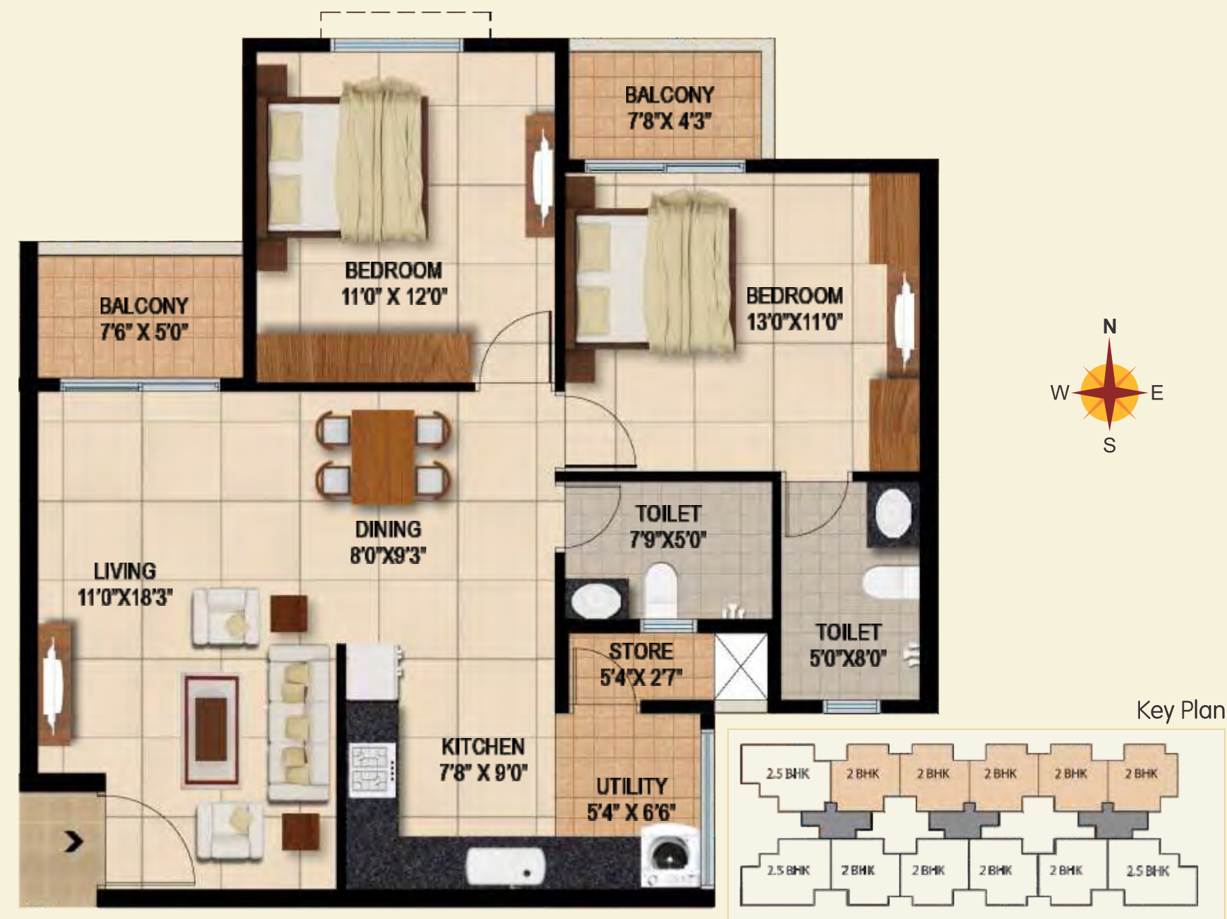
2 Bed + 2 Bath | Area: 1050 sqft

TYPICAL FLAT NUMBERS: A-104 to A-904 B-103 to B-903 B-104 to B-904 C-103 to C-903 C-104 to C-904