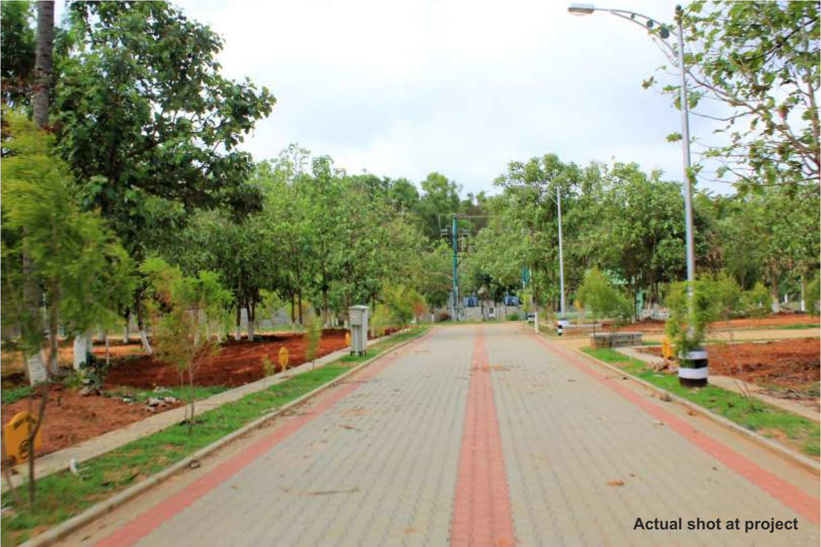
Actual shot at project

LEGEND : 1. Parks & landscaped gardens | 2. Jogging track| 3. Gymnasium 4. Indoor Badminton court | 5. Swimming pool | 6. Children play area | 7. Gazebo