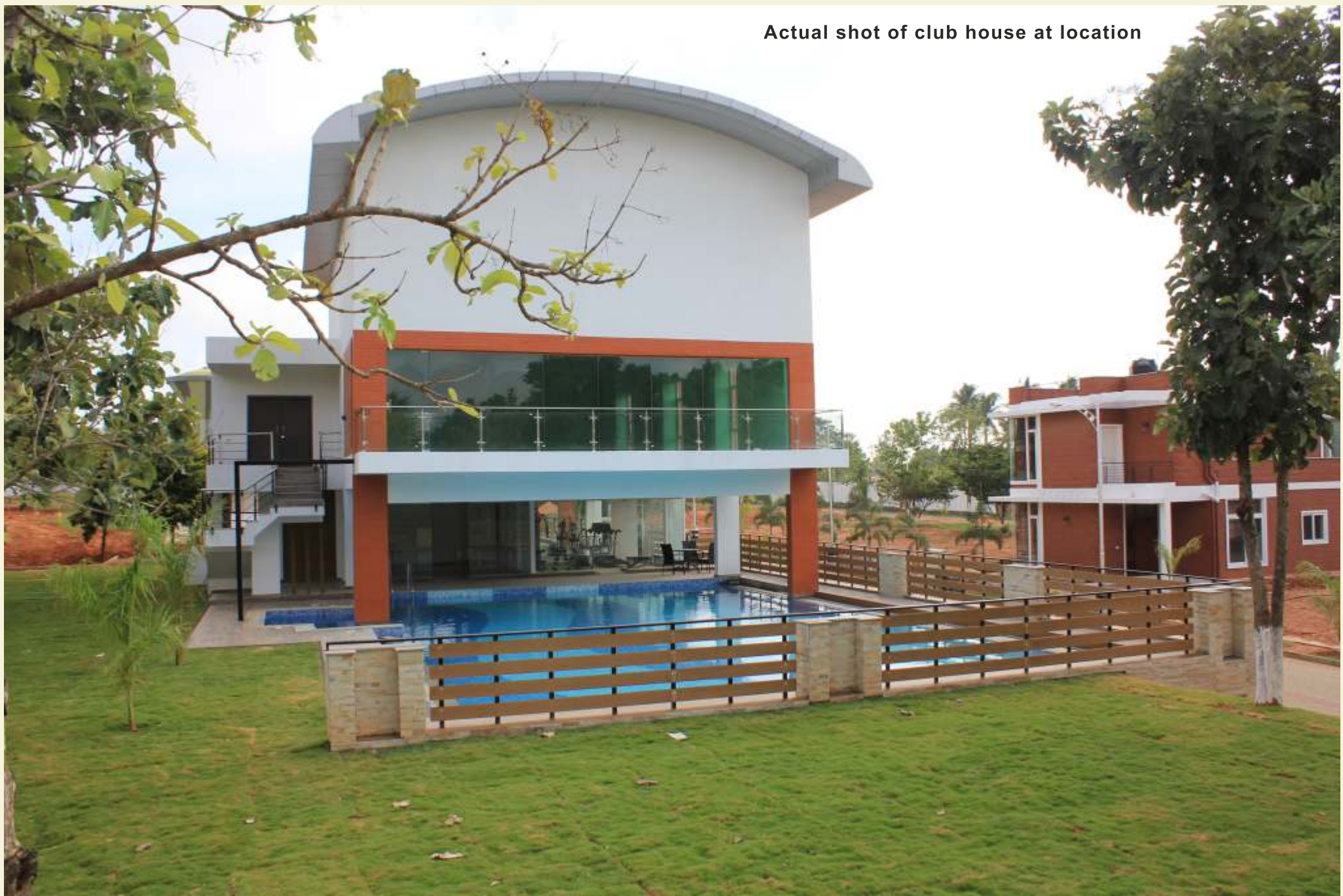
Actual shot of club house at location